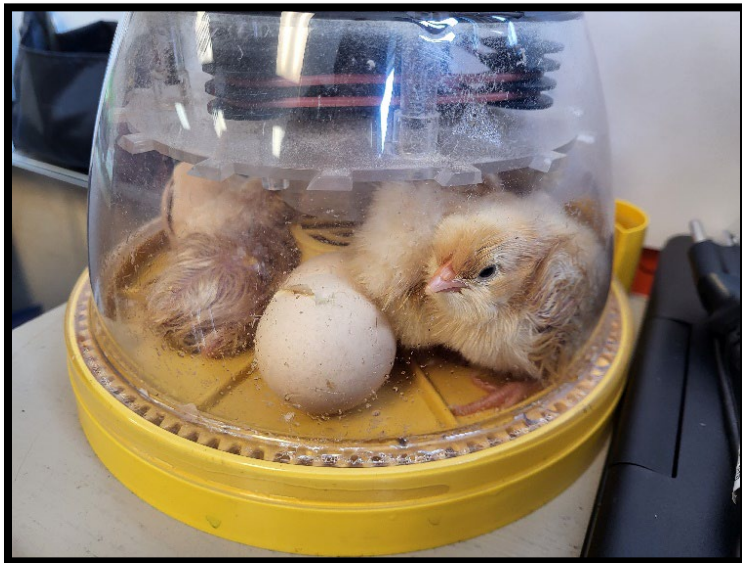
Grade 1 /2 classroom had chicks!

These students will compete at the GSSD Showcase Meet on June 7th at Century Field in Yorkton. Way To Go!